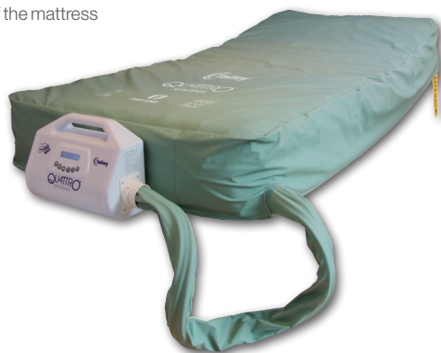
FIGURE 1. The QUATTRO Sentinel active therapy support surface from Talley

The primary aim of this retrospective analysis was to report the clinical progress of patients nursed on the Talley QUATTRO Sentinel active therapy support surface (see Figure 1) in an acute care setting. The secondary aim was to report user acceptance of the mattress system.